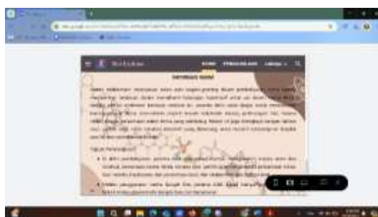
Figure 4. General information and Objectives view

General information includes students' understanding of stoichiometry material, learning objectives are KD, indicators and learning objectives to be achieved. The display of general information and learning objectives can be described as follows