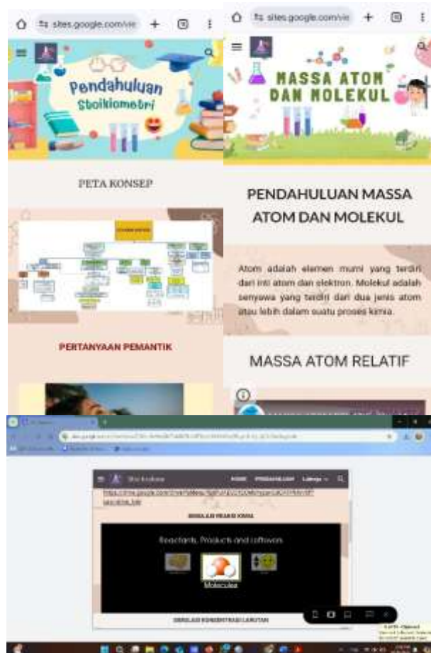
Figure 5. Materials view

results & percentage of results, and gas stoichiometry. The material display can be described as follows.