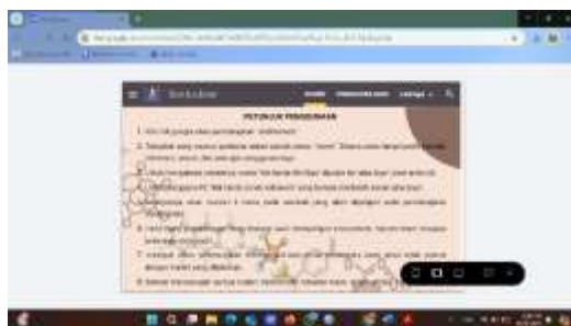
Figure 3. Instructions for use view

Instructions for use are a guide for students to know how to use Google site media contained on the website. The display of instructions for use can be described as follows