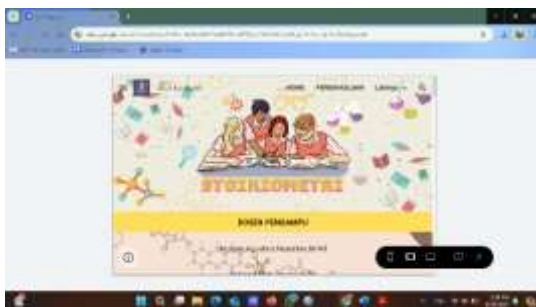
Figure 2. Main page view

The main page or Home menu is the initial appearance of the website. It consists of a cover, instructions for use, general information, learning objectives, and a list of menus. There are ten menus available on this media which include materials about stoichiometry, practice questions, and a bibliography. The Home view can be described as follows.