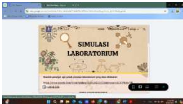
Figure 7. Laboratory Simulation view

Laboratory Simulation is used as a virtual testing stage for students related to the material that has been studied. On this page, the laboratory simulation used is an application that can be accessed from the web called Phet Colorado. On the page, instructions for using the web are displayed. The laboratory simulation display is described as follows.