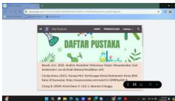
Figure 8. Bibliography view

On this page, citations and reference sources are entered sequentially to ensure the quality of the website that has been provided.